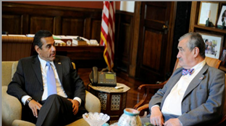
Office of the Mayor – Minister Schwarzenberg meeting with Mayor Villaraigosa

After countless promising meetings, the Minister and his delegation visited the Ronald Reagan Presidential Library and Museum in Simi Valley. Minister Schwarzenberg also exchanged inspiring ideas with the former governor of California, Mr. Arnold Schwarzenegger. Both events gave a lasting impression of the state of California: its history coupled with current affairs. Overall, the Minister deemed the trip a resounding success, with high hopes for the perseverance and maturity of Czech-American relations.